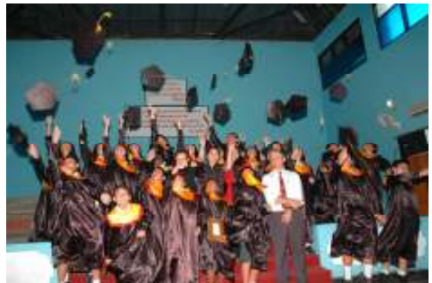
Graduating Class 2007

This year (2009) the CIPP will graduate 43 students and we currently have 190 students in 11 classes from grade 1 through to grade 6.