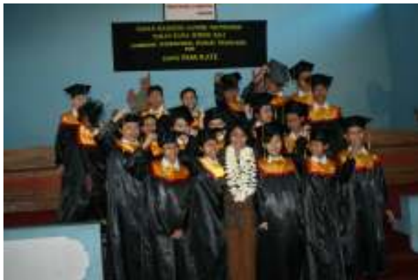
Graduating Class 2008

The Cambridge International Primary Programme at Taman Rama School is an excellent preparation for Cambridge Secondary education, such as CLSP and IGCSE. CIPP students graduate with much more than a certificate from Cambridge International Examinations. CIPP students graduate with excellent English language skills and sound knowledge across all domains and this gives them the confidence to succeed and excel in secondary education.